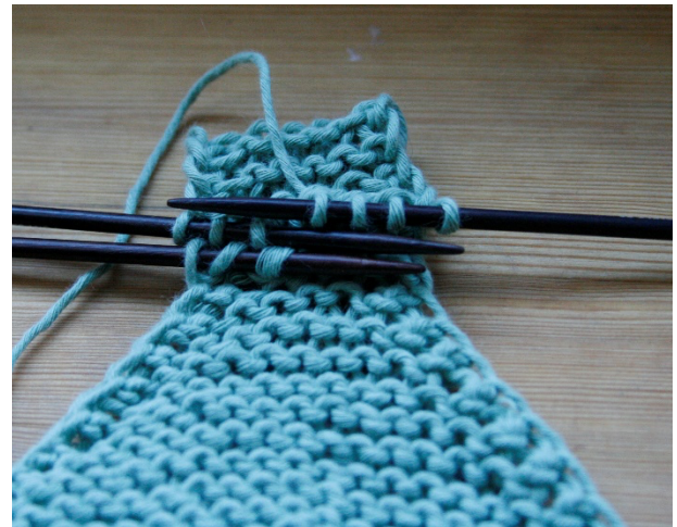
Picture 2: Work the stitches from both needles together crossing the loops from both needles on the left-hand