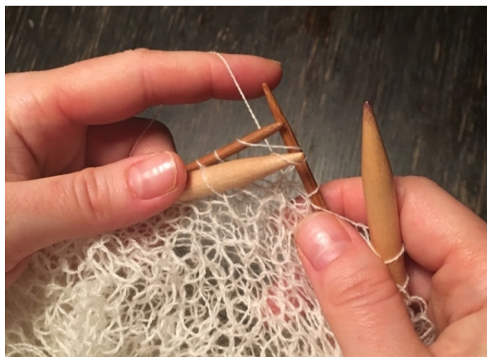
Illustrative photo 1: joining the two ruffles

Working with the smaller needle in your right hand push it through the first st on the larger needle, then through the first st on smaller needle and knit them together.