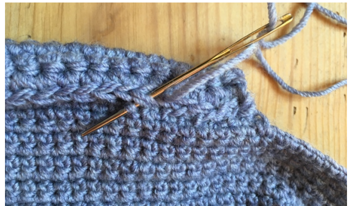
Picture 5 – with tapestry needle sew the last row to the first row of the peak. Don't worry if the edges aren't smooth, you will add one more sc round.

Fold the peak inside from the middle (4 th -5 th row) and sew it in place (Picture 5).