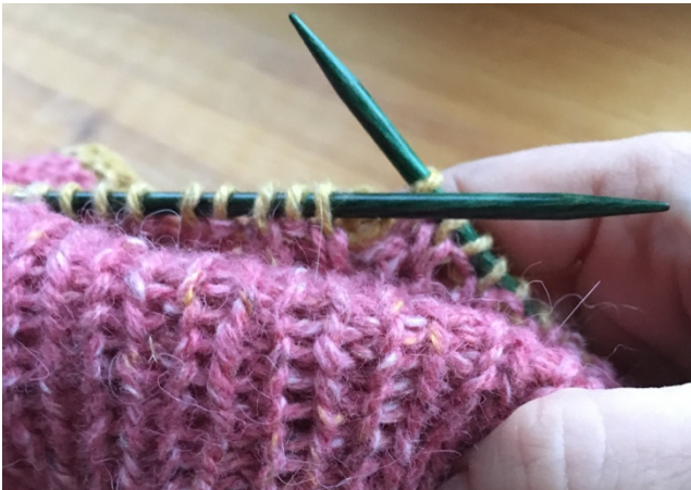
Picture 2: working the 3 rd round of the cowl, make sure the inner cowl will be behind the outer cowl.

Change to CC and repeat Round 1 until the piece measures 1.5/2/3.5/3.5" (that is 4/5/9/9 cm) from the pick-up row, change to MC and continue few rounds more until it measures 2.5/3/4.5/4.5" (that is 6/8/11/11 cm).