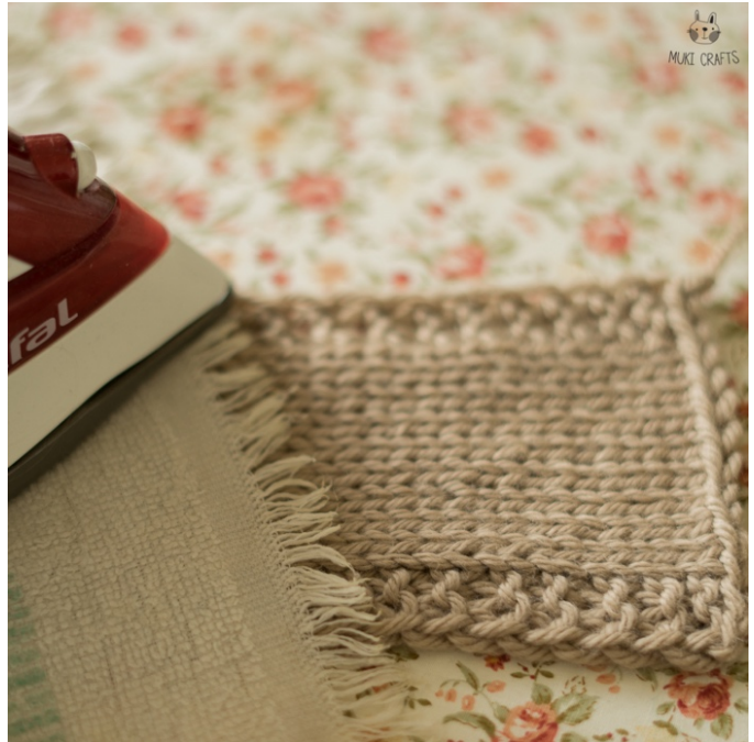
2. Pressing the headband under a wet cloth

Sew the cast on row to the bind off row, weave in all ends. Decorate the headband with two pom-poms with a diameter of about 1,5" (3 cm).